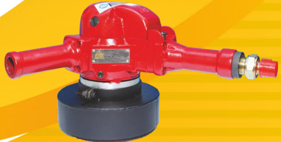
Angle Grinder CAT 310