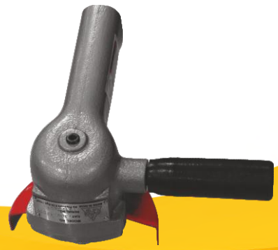
Angle Grinder CAT 308