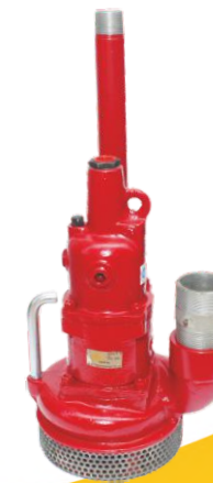
Sump Pump CAT 202