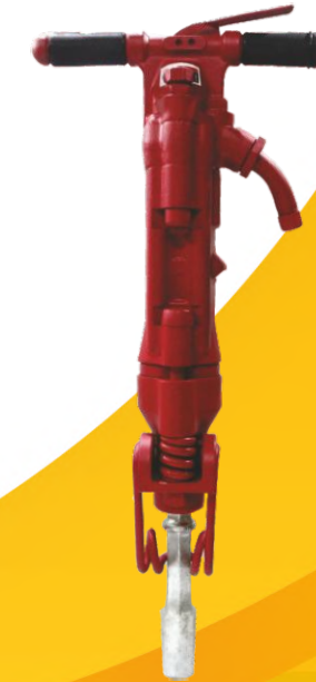
Breaker CAT 1700