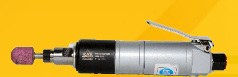
Die Grinder CAT 0025L