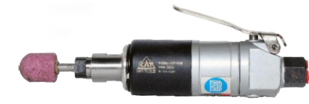
Die Grinder CAT 0025M