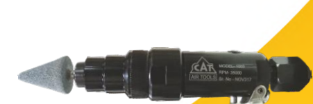
Die Grinder CAT 1003