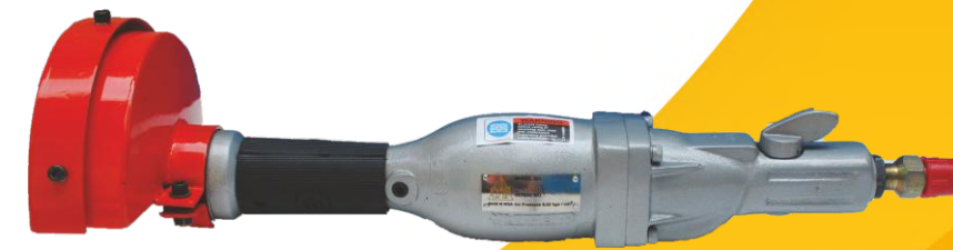
Straight Grinder, CAT 0150