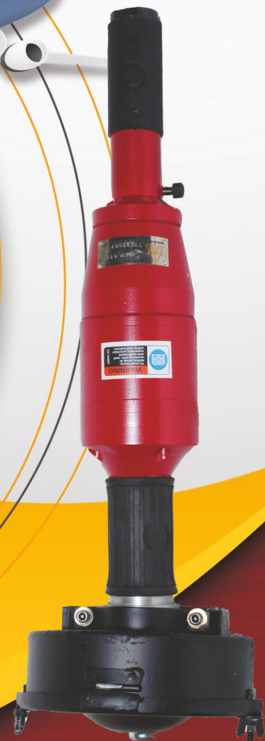
HEAVY DUTY STRAIGHT GRINDERS