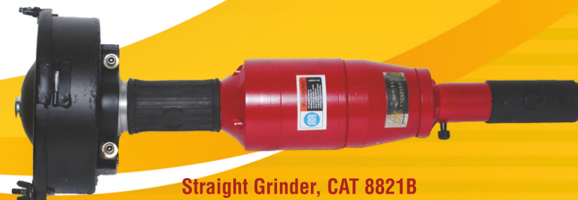
Straight Grinder, CAT 8821B