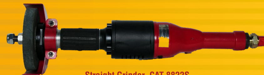
Straight Grinder, CAT 8822S