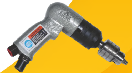
DRILLS CAT D010