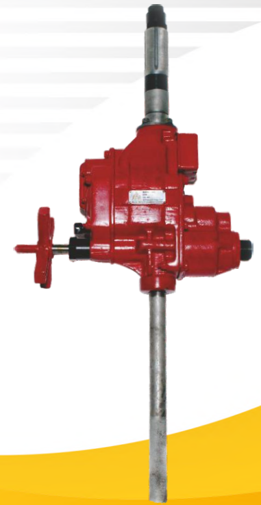
HEAVY DUTY DRILLS CAT 4290